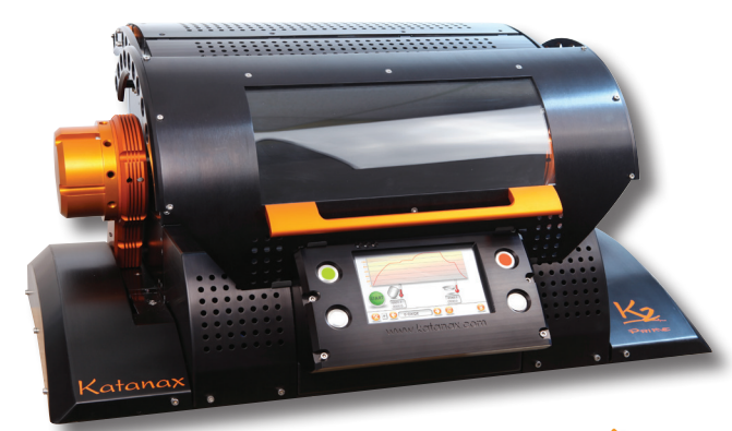
к1 SINGLE Sample

Voltages: 110-127 / 220-240 VAC Power (max.): 1300W Height: 47 cm (19 ln.) Width: 28 cm (10.9 ln.) Depth: 66 cm (26 ln.) Mass: 30 kg (66 Lbs.) CE